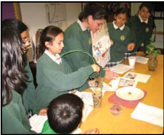
Vegetative Propagation Experiment

To prepare for the science portion of the evening, students work in groups to pick a topic, develop and conduct their experiment, and then write up their results. Then students make posters and prepare samples of their experiments. During the evening, as students present their experiments, guests have the