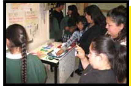
Crystal Garden Experiment

propagation (7th grade), to physics demonstrations and chemical reactions (8th grade). At Our Lady of Grace, a 6th grade team prepared a crystal garden experiment to show how scientists use