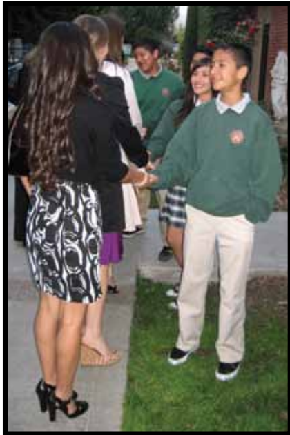
Students greeting guests

On March 6, 2010 our students greeted over 450 guests with a handshake, eye contact and words of welcome as they entered The