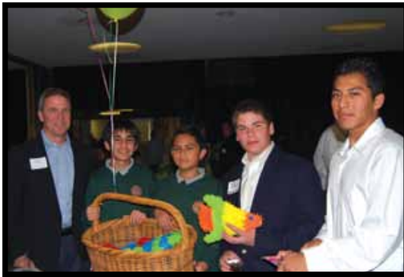
Students selling piñatas

Meanwhile, students were busy selling 100 fish piñatas for $100 each for the chance to win a one-week stay at the luxurious Villa La Estancia located in Cabo San Lucas. Guests were so excited at the chance to win such a fabulous vacation that many couples bought two fish piñatas.